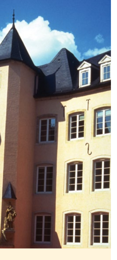
FOR MORE INFORMATION PLEASE VISIT northerntrust.com