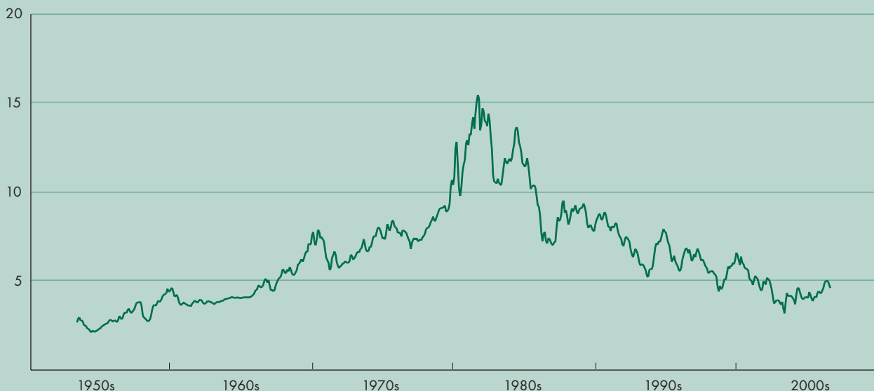
EXHIBIT 1: 10-YEAR TREASURY CONSTANT MATURITY RATE